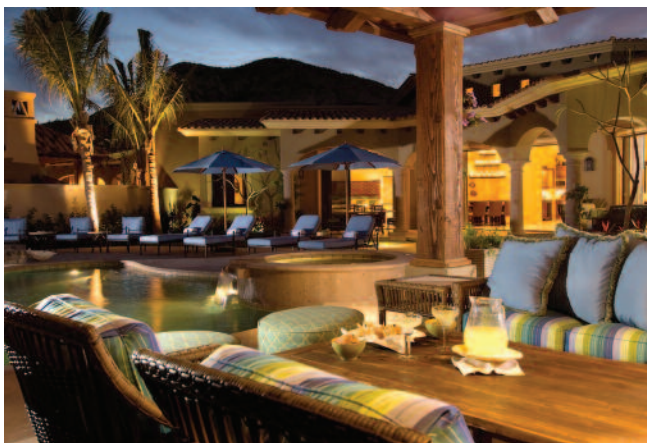
Quintess/The Leading Residences of the World has 525 members sharing 70 homes, including this beautiful property in Los Cabos.

The MSCCC won’t lack for “nice things.” Plans call for an equestrian facility (many of the wives are big horse buffs, Wagner explains) and an elegant country club lodge and spa, with pool and fitness center facilities; members-only bar, wine tasting room, cigar bar, private lounges and restaurant; and luxury trackside residences with garage and living spaces.