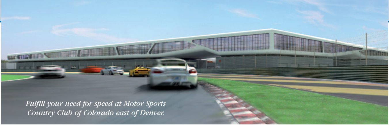
Fulfill your need for speed at Motor Sports Country Club of Colorado east of Denver.