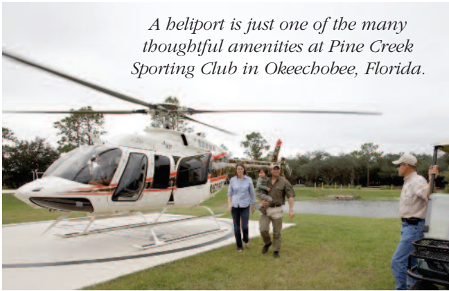
A heliport is just one of the many thoughtful amenities at Pine Creek Sporting Club in Okeechobee, Florida.