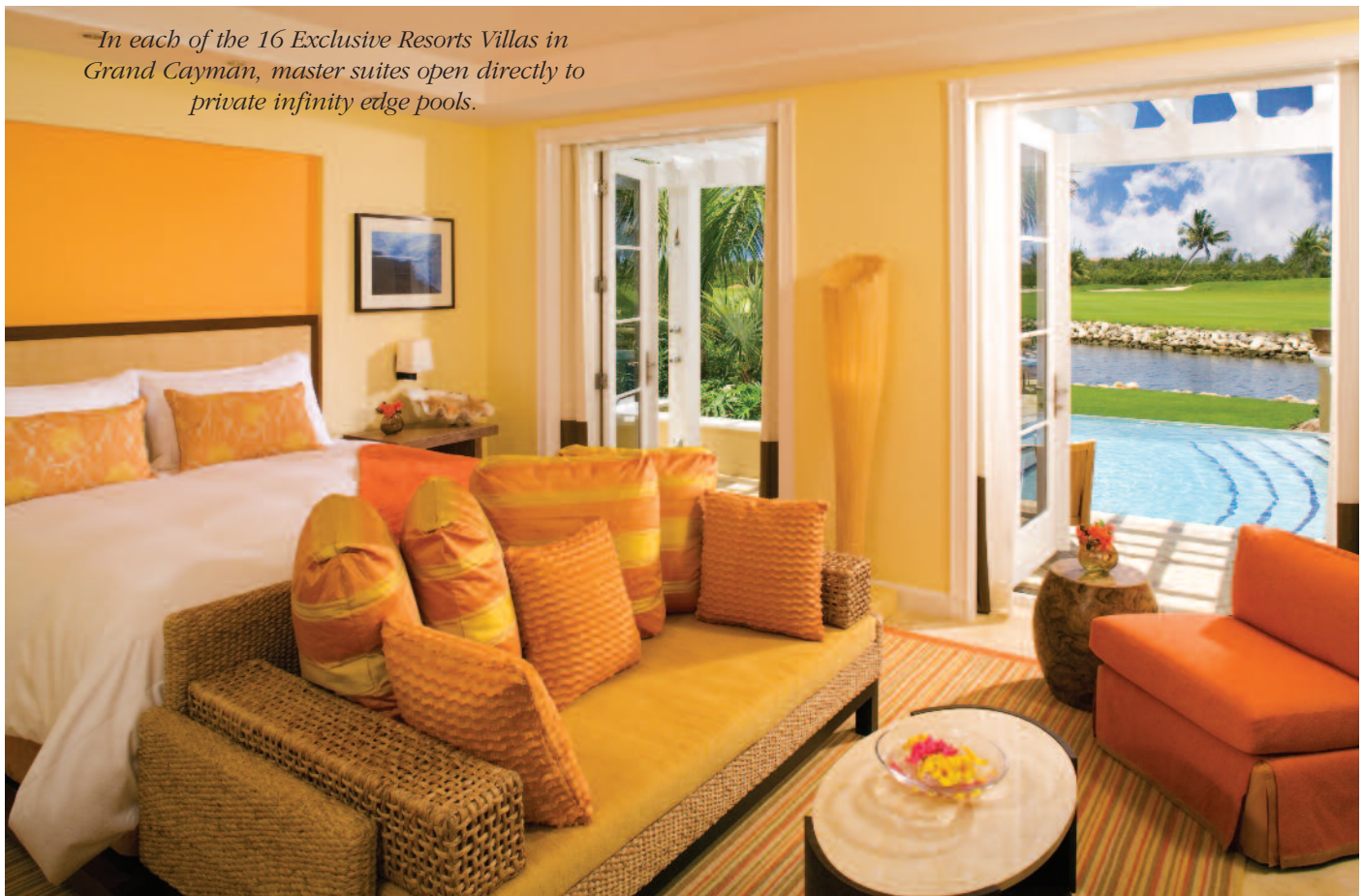
In each of the 16 Exclusive Resorts Villas in Grand Cayman, master suites open directly to private infinity edge pools.

Another new venture is the club's HomeWaters University, where students can learn fly casting and practice real-life fly fishing situations on the Lefty Kreh Challenge Course offering dry-land, still-water and moving-water stations.