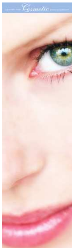
Social Affairs Magazine™